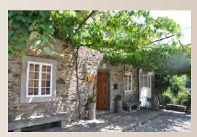
You can book the accommodations in this guide in JUST ONE STEP