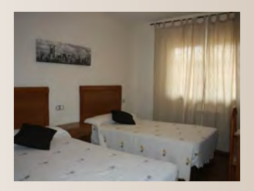
You can book the accommodations in this guide in JUST ONE STEP