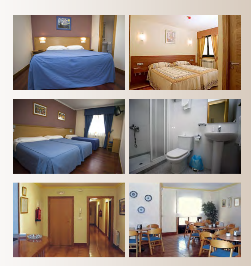
You can book the accommodations in this guide in JUST ONE STEP