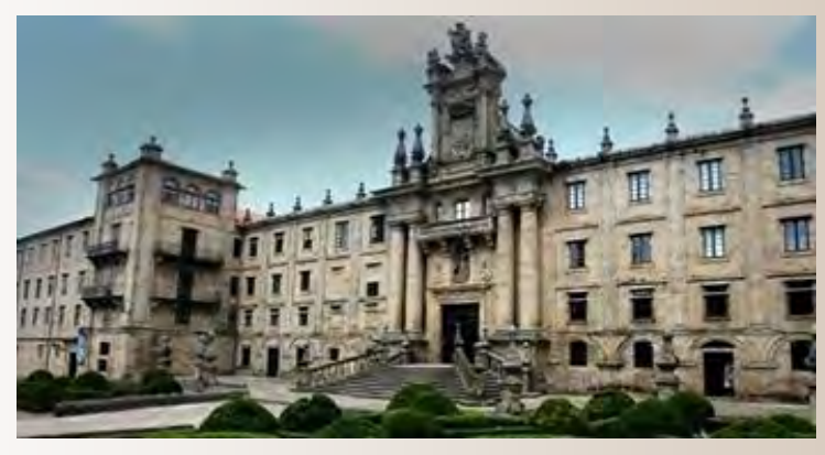
You can book the accommodations in this guide in JUST ONE STEP